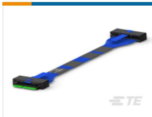
TE Part #2324305-1 C/A, SLIVER 124P, STR TO STR