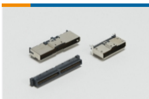
Internal I/O Connectors(133)