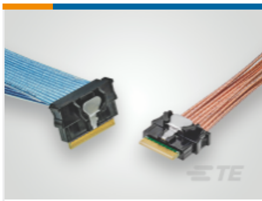
TE Part #2821385-1 SLIVER C/A, 74P, R/A TO R/A, 10GHZ, 85OHM