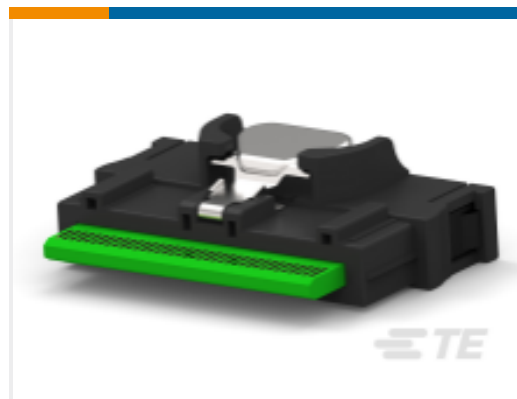
TE Part #2317823-1 CABLE PLUG KIT, SLIVER 74P