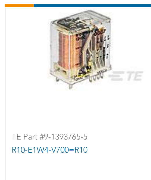
TE Part #9-1393765-5 R10-E1W4-V700=R10