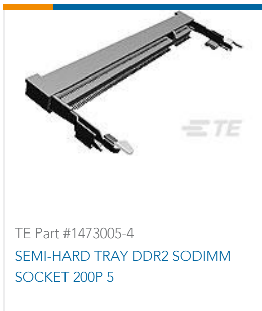
TE Part #1473005-4 SEMI-HARD TRAY DDR2 SODIMM SOCKET 200P 5