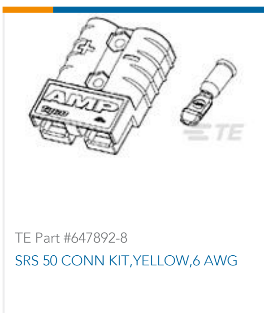
TE Part #647892-8 SRS 50 CONN KIT, YELLOW, 6 AWG