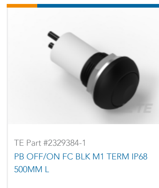
TE Part #2329384-1 PB OFF/ON FC BLK M1 TERM IP68 500MM L