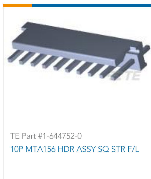
TE Part #1-644752-0 10P MTA156 HDR ASSY SQ STR F/L