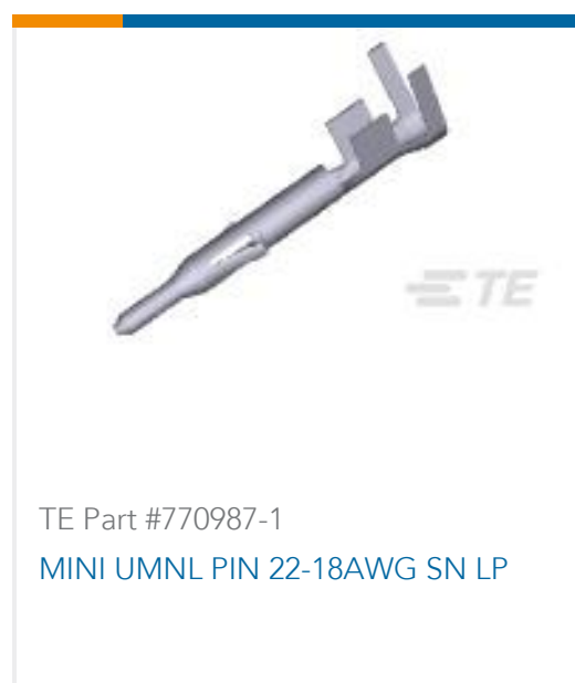
TE Part #770987-1 MINI UMNL PIN 22-18AWG SN LP