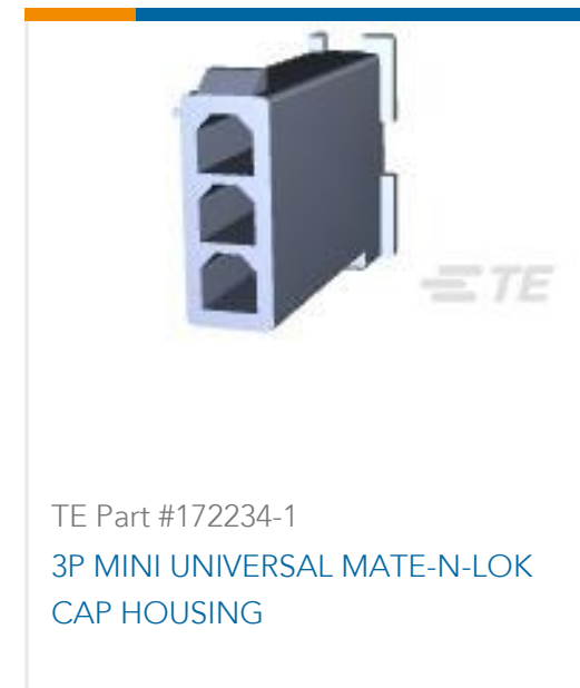
TE Part #172234-1 3P MINI UNIVERSAL MATE-N-LOK CAP HOUSING