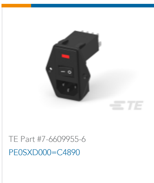
TE Part #7-6609955-6 PE0SXD000=C4890