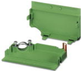
Cable housing, pitch: 0 mm, number of positions: 8, dimension a: 40 mm, color: green

Please be informed that the data shown in this PDF Document is generated from our Online Catalog. Please find the complete data in the user's documentation. Our General Terms of Use for Downloads are valid ( http://phoenixcontact.com/download )