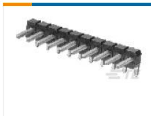
TE Part #9-103329-0 40 MODII HDR SRRA B/A .100 CL LF