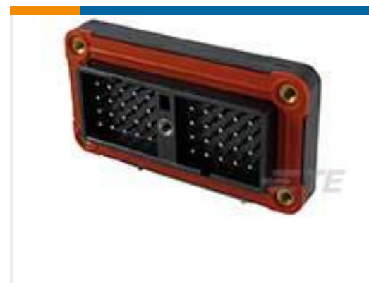
TE Part #DRC13-40PA HDR, 40P, BLK, RA, 1032 FLG, SN/NI /CU, A