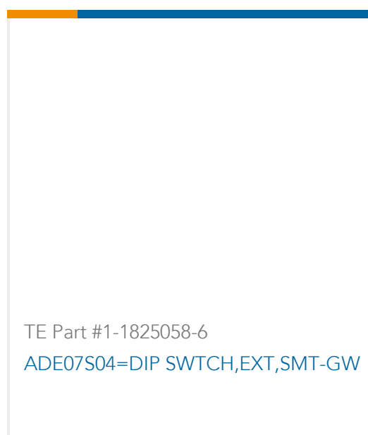
TE Part #1-1825058-6 ADE07S04=DIP SWTCH,EXT,SMT-GW