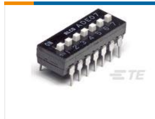
TE Part #1-1825058-9 ADE08S04=DIP SWTCH,EXT,SMT-GW