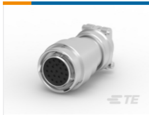
TE Part #HD36-18-21SN-059 PLG,21P,AL,N, CBL CLMP BT, DRAIN, 20,S,MC