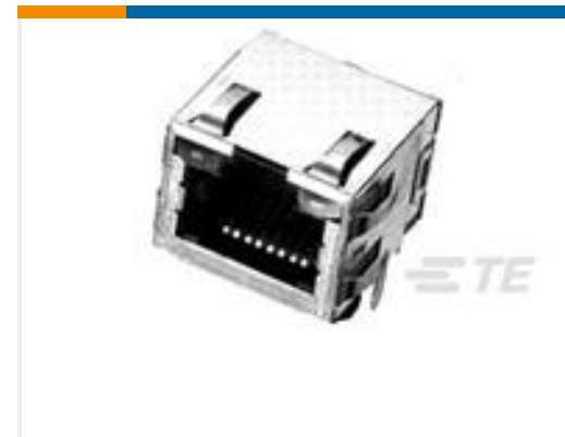
TE Part #1-406507-4 IMJ,1X1,P GRD,INSLT,LED(Y/G)SN