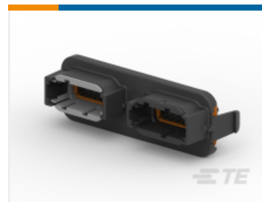
TE Part #DTM1312PA12PBR008 HDR, 24P, BLK, RA EEC, NI/CU, AB