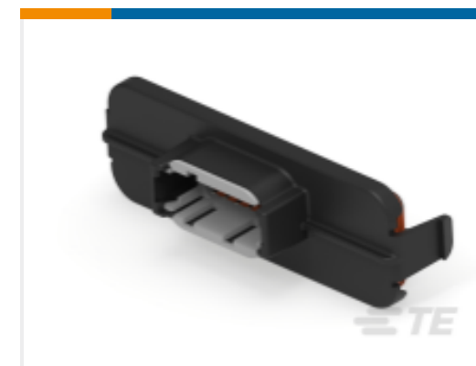
TE Part #DTM13-12PA-R008 HDR, 12P, BLK, RA EEC, NI/CU, A