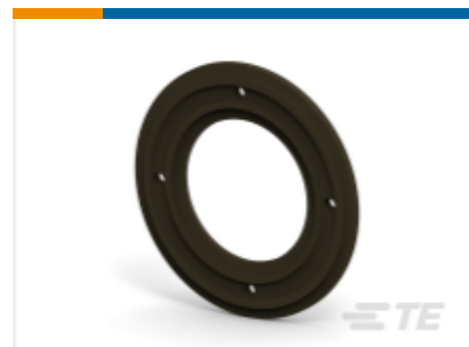
TE Part #2332473-1 GASKET, TOOL-LESS DIMMING RECPT SEALING