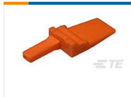
TE Part #WM-2P WEDGE LOCK, 2P, REC, ORG, DTM