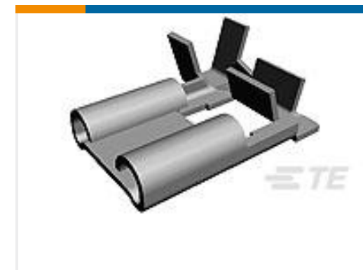
TE Part #63012-2 250 FASTON FLAG REC 18-14 AWG TPBR