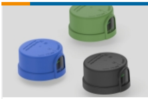
Street Lighting Photocells(9)