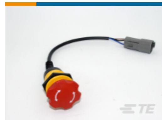
TE Part #K1161759 Emergency Stop Switch ES-2002-T312-020B