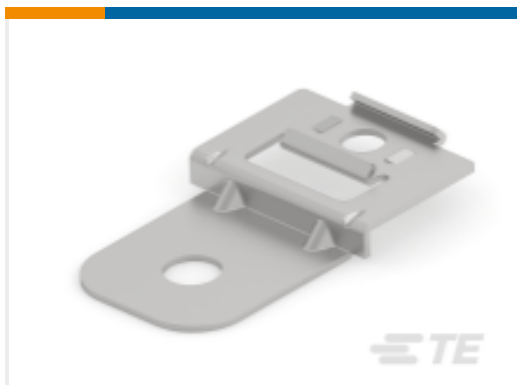
TE Part #1027-017-1200 CLIP, STEEL, ZINC, 8.2MM HOLE, SIDE