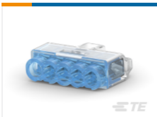
TE Part #2324697-5 PUSH GRIP CONNECTOR 5P