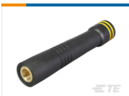
TE Part #ANT-916-CW-HD Antenna 1/4 Wave HD Whip 916MHz RPS