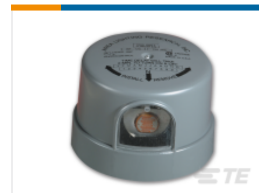
TE Part #636452-000 ALR-M-480