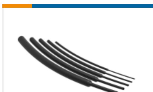
TE Part #NB20034001 VERSAFIT-1/4-0-SP