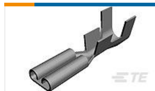
TE Part #41274 250 FASTON,REC.,18-14 AWG,TPBR