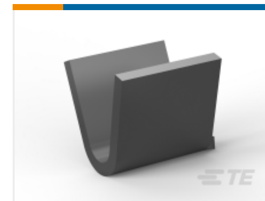
TE Part # 61299-2 SPLICE 7000-12500 .032 TPBR