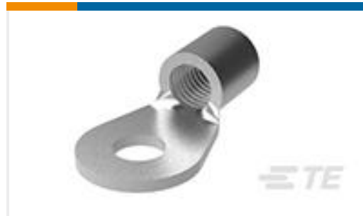
TE Part #33460 TERMINAL,SOLIS R 8 10