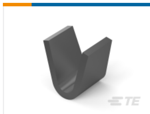
TE Part # 61008-1 SPLICE 18-16 AWG .0158 TPST