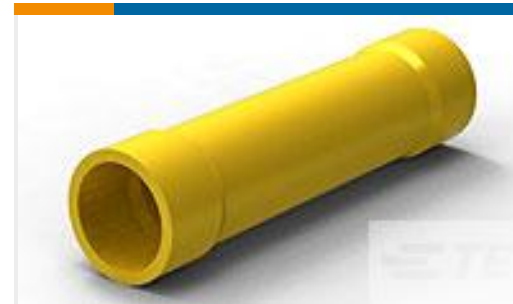
TE Part #34072 SPLICE,PG BUTT 12-10