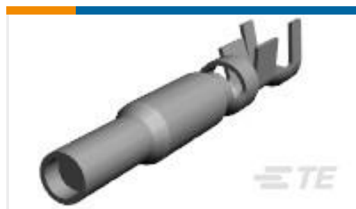
TE Part #770008-3 UMNL II SOK PTPPHBZ