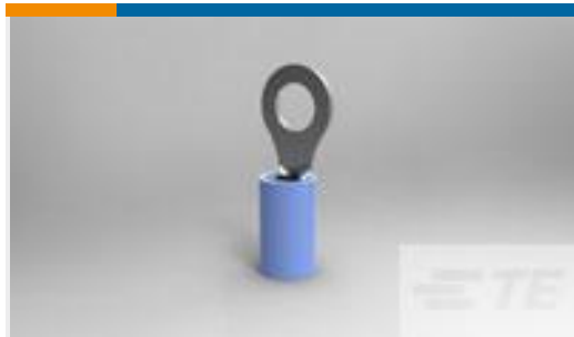
TE Part #36160 TERMINAL,PIDG R 16-14 10