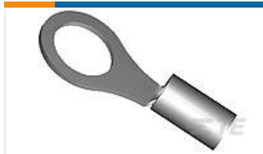
TE Part #322335 TERMINAL,SOLIS R HT 16-14 10