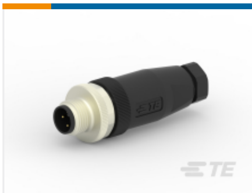
TE Part #T4111001041-000 RPC-M12-MS-4CON-PG7-MU