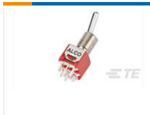
TE Part #2267079-2 TMS6T3B1M1QE