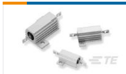
TE Part #4-1879075-6 THS25 560R 5%