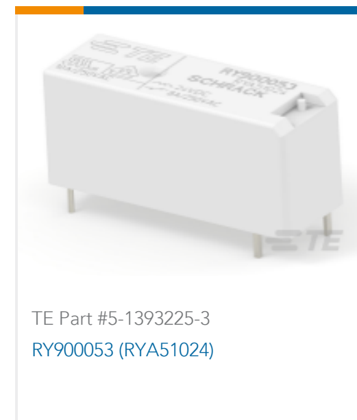
TE Part #5-1393225-3 RY900053 (RYA51024)