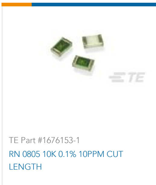
TE Part #1676153-1 RN 0805 10K 0.1% 10PPM CUT LENGTH