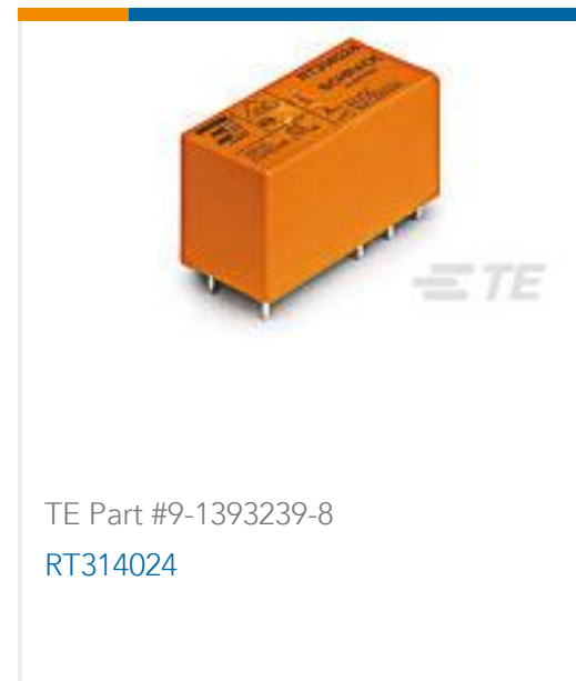
TE Part #9-1393239-8 RT314024