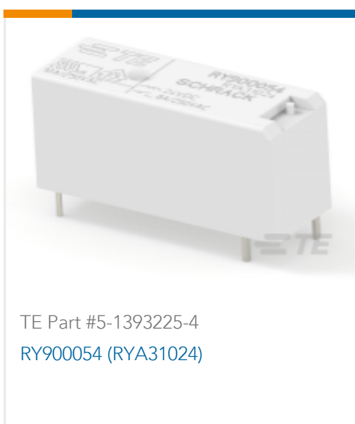
TE Part #5-1393225-4 RY900054 (RYA31024)