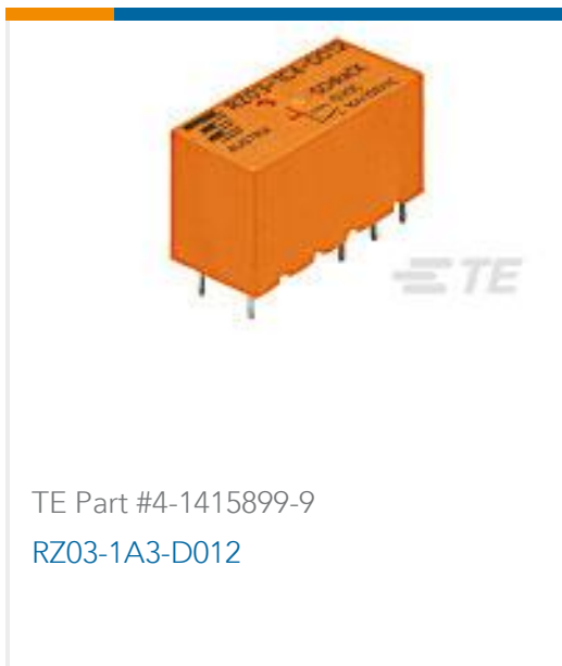
TE Part #4-1415899-9 RZ03-1A3-D012