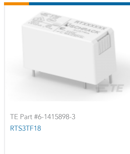
TE Part #6-1415898-3 RTS3TF18