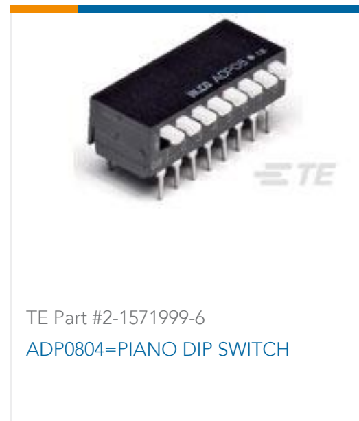
TE Part #2-1571999-6 ADP0804=PIANO DIP SWITCH