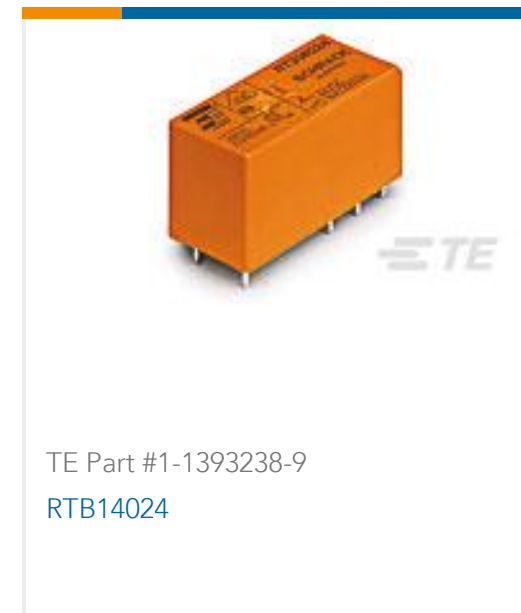
TE Part #1-1393238-9 RTB14024