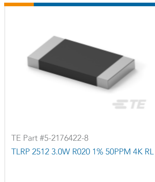
TE Part #5-2176422-8 TLRP 2512 3.0W R020 1% 50PPM 4K RL