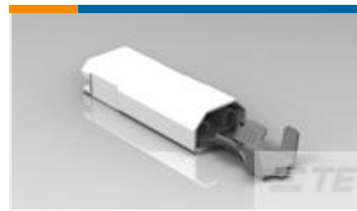
TE Part #521632-2 ULTRA-POD 250 ASSY REC 18-14 AWG TPBR