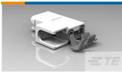
TE Part #521411-1 ULTRA-POD 250 ASY REC 22-18 AWG BR