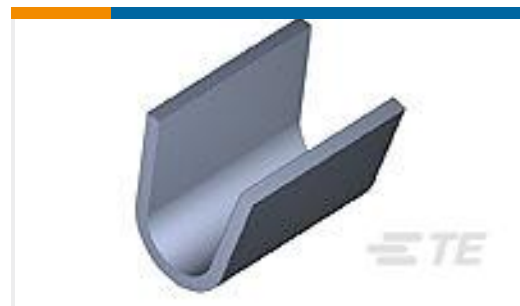
TE Part #61769-1 SPLICE 1200-2600 .020 BR