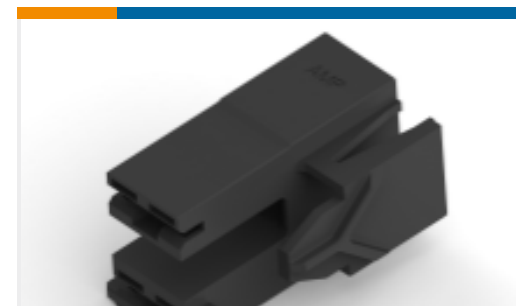
TE Part #5-1969536-4 HSG, RECP, POSILOK MKIII, 250SER, 3P, 2CIR