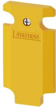
Cover yellow for position switch metal 3SE51, enclosure, according to EN 50041