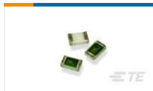
TE Part #7-1879215-2 CPF 0402 25K5 0.1% 25PPM 1K RL