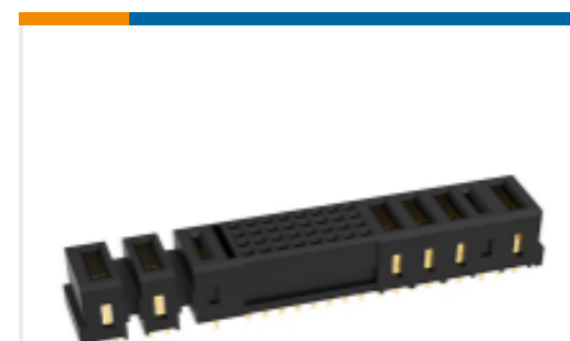
TE Part #2313441-1 MULTIBEAM, VERT ASSY, VITA 62.2, PRSSFIT