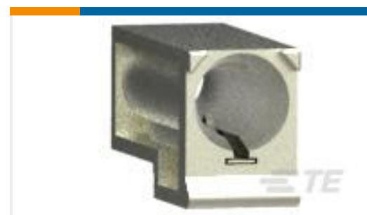
TE Part #1-1469492-1 MULTIGIG RT 9MM GUIDE/ESD 0 DEG