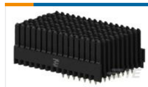
TE Part #1410965-1 MULTIGIG RT T2 .8" BP FULL CNT