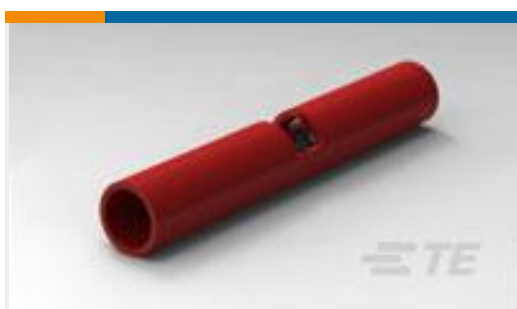
TE Part #8-320559-5 SPLC BUTT PIDG 22-16C 22-18M