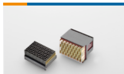
TE Part #2313238-1 VERTRECCASSY, J0/J1A, MULTIGIG RT3