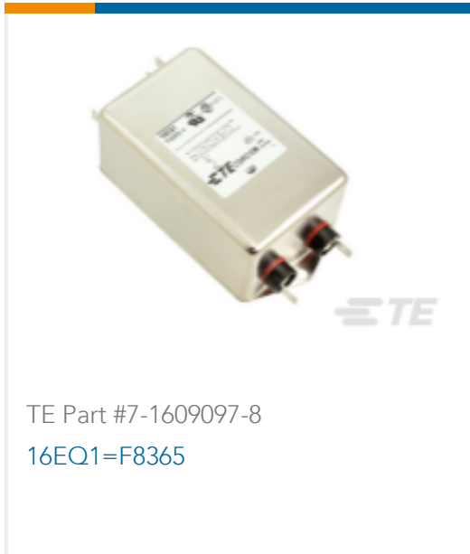
TE Part #7-1609097-8 16EQ1=F8365