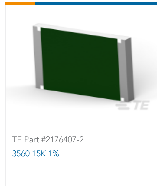
TE Part #2176407-2 3560 15K 1%