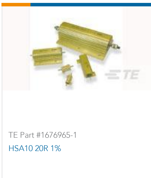
TE Part #1676965-1 HSA10 20R 1%