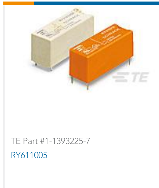
TE Part #1-1393225-7 RY611005