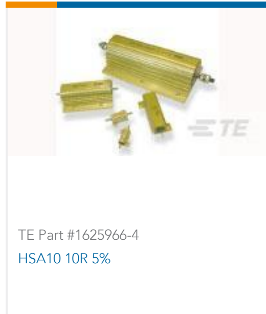
TE Part #1625966-4 HSA10 10R 5%