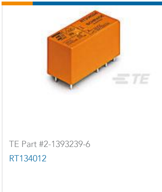
TE Part #2-1393239-6 RT134012