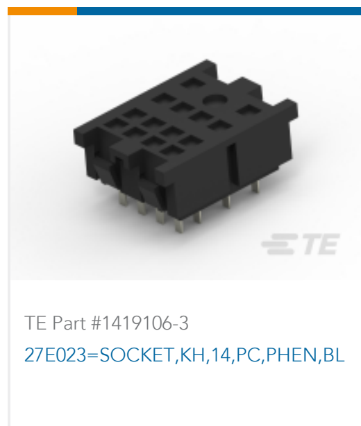
TE Part #1419106-3 27E023=SOCKET,KH,14,PC,PHEN,BL