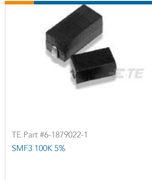
TE Part #6-1879022-1 SMF3 100K 5%