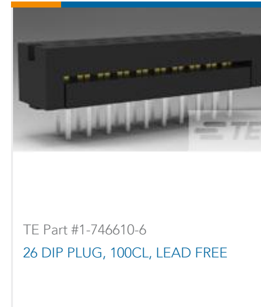
TE Part #1-746610-6 26 DIP PLUG, 100CL, LEAD FREE