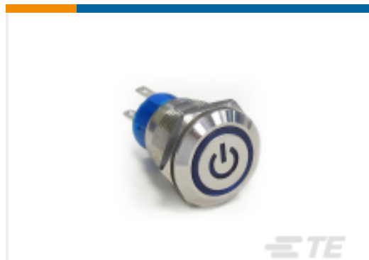
TE Part #5-2213766-3 AV19 DPM 3A POWER LED GREEN 12V