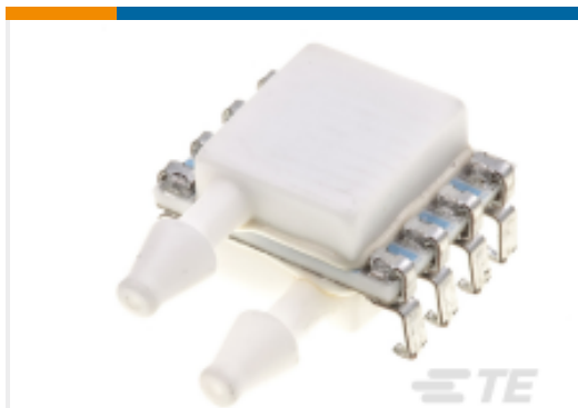
TE Part #4515DO-DS3BK004DP 4IN PCB MOUNT I2C DIFF PRESSURE SENSOR