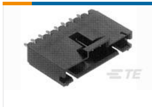
TE Part #1-103638-0 11 MTE HDR SRST LATCH .100CL