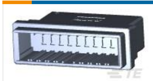
TE Part #178964-8 DYNAMIC D-3 W-T-W TAB HSG 20P