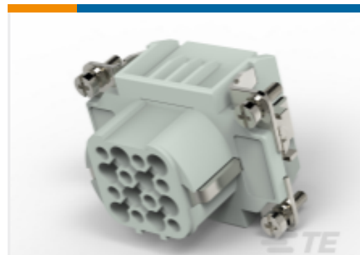
TE Part #T2030162201-000 HDD-016-F