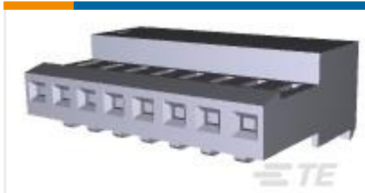
TE Part #3-640441-8 08P MTA100 CONN ASSY WHT