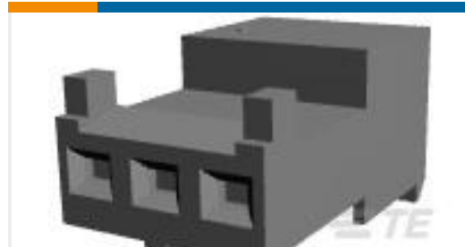
TE Part #3-643814-3 03P MTA100 CONN ASSY POL RIB