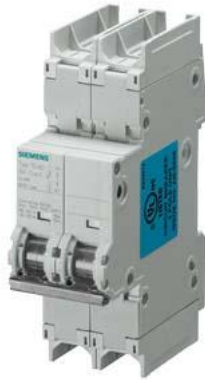
Miniature circuit breaker 240 V 14kA, 2-pole, D, 6 A, D=70 mm according to UL 489