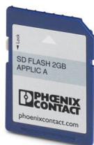
Program and configuration memory, for extending the internal flash memory, pluggable, 2 GB.

https://www.phoenixcontact.com/us/products/2988162