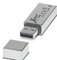
USB memory stick, 8 GB

https://www.phoenixcontact.com/us/products/2402809