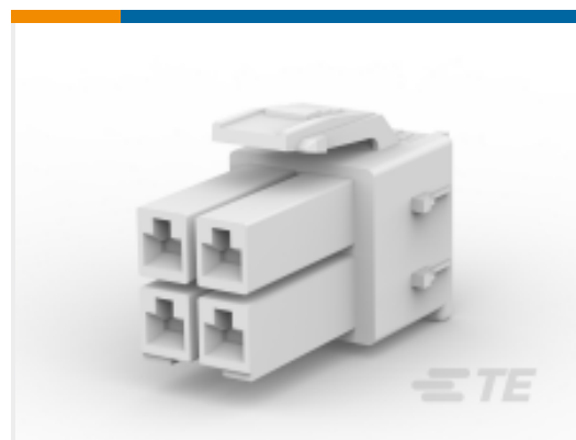
TE Part # 177900-1 POWER DBL LOCK PLUG HSG 4P