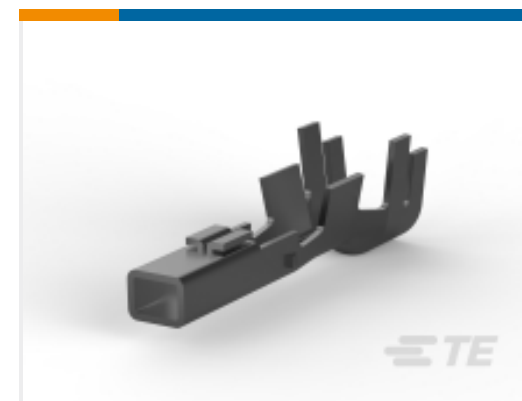
TE Part # CAT-P87024-R2435 Power Double Lock Receptacle