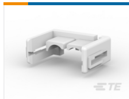
TE Part # 177918-1 POWER DBL LOCK PLATE 2P