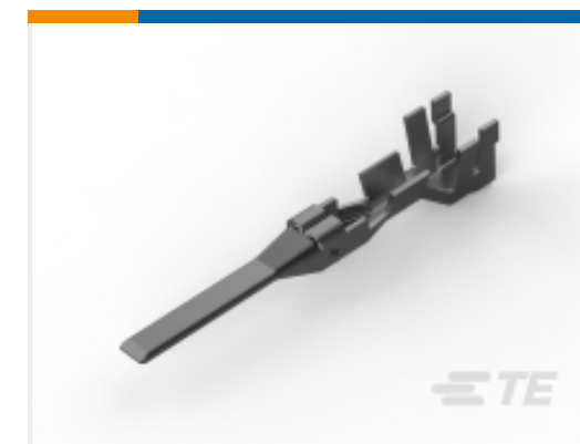
TE Part # CAT-P87024-T111 Power Double Lock Tab