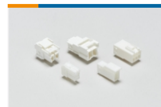
Rectangular Power Connectors(283)