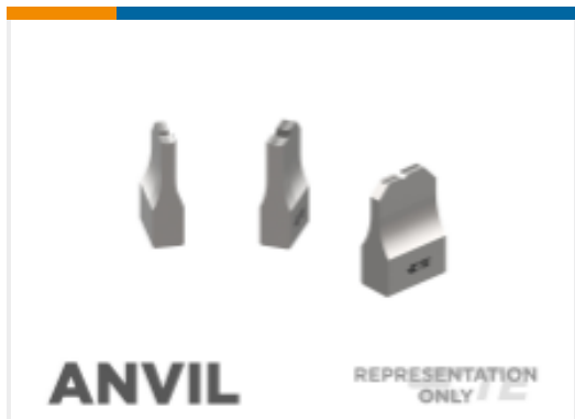
TE Part #1-1729372-1 ANVIL