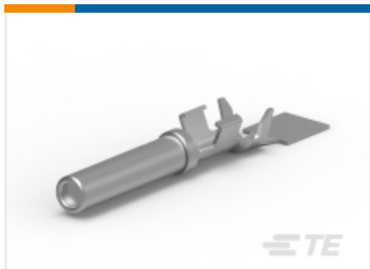
TE Part #1060-16-0122 DEUTSCH Size 16 Crimp Contacts