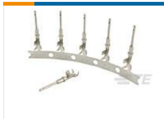
TE Part #1060-20-0122 PIN, SF, SIZE 20, 16-22, NI/NI