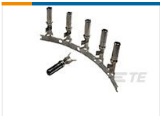
TE Part #1062-12-0166 SOC, SF, SIZE 12, 12-14, NI/SN