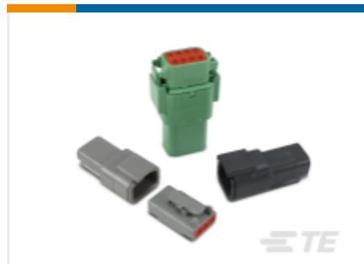
TE Part #DTM06-4S DEUTSCH DTM Housings