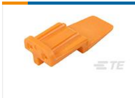
TE Part #WM-2S WEDGE LOCK, 2P, PLG, ORG, DTM