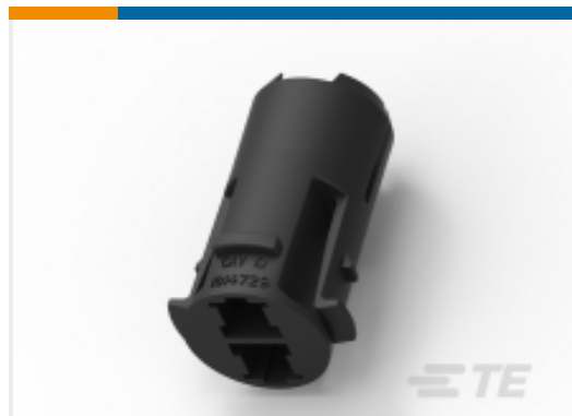
TE Part #1814729-4 BULB HOLDER LATCHED