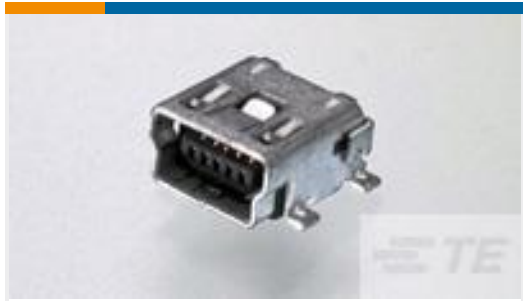
TE Part #1734035-2 MINI USB, TYPE B, R/A, SMT