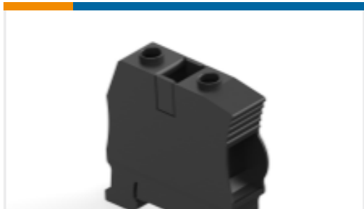
TE Part #1SNK516064R0000 ZS50-BK