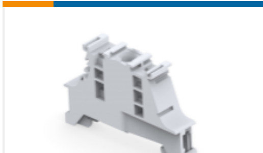
TE Part #1SNK900001R0000 BAM4