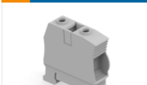
TE Part #1SNK516011R0000 ZS50