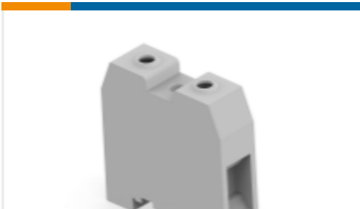
TE Part #1SNK522010R0000 ZS70