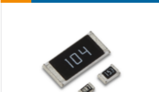
TE Part #2176347-1 CRGCQ 2010 10R 1%