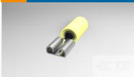
TE Part #640907-1 RECEPT,PIDG FASTON 12-10 250