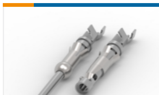
TE Part #66101-3 Pin and Socket Contacts, Type III, LP