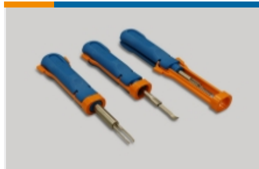
Insertion &amp; Extraction Tools(4)