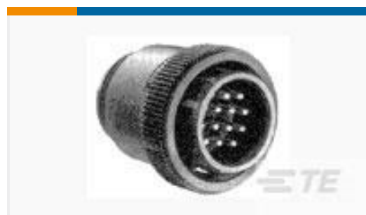
TE Part #206429-1 CPC PLUG ASSY, 11-4, REV SEX