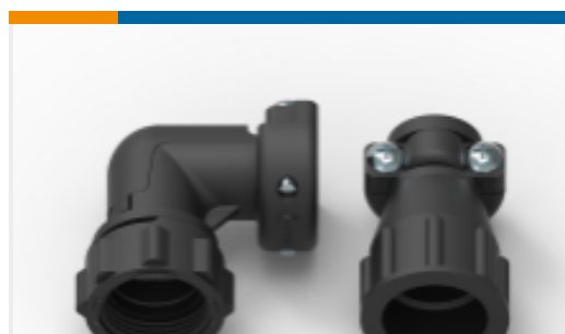
TE Part #206966-7 CPC Cable Clamps