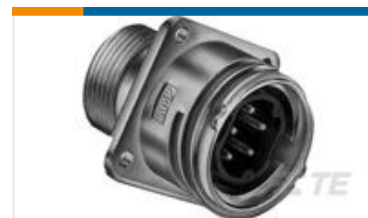
TE Part #208719-1 RECEIPT ASSY, SZ 14, CPC