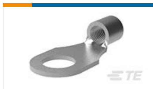
TE Part #327175 TERMINAL, SOLIS R 4 1/2