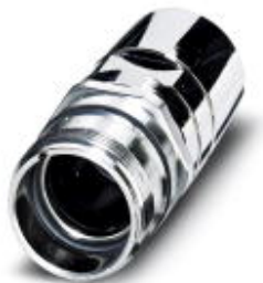
Sleeve housing for coupler connector, straight, Screw locking, M23, shielded: no

Please be informed that the data shown in this PDF Document is generated from our Online Catalog. Please find the complete data in the user's documentation. Our General Terms of Use for Downloads are valid ( http://phoenixcontact.com/download )