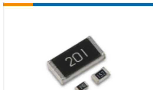
TE Part #4-2176328-4 CRGP 1206 39K 1%