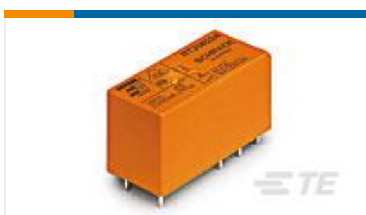
TE Part #3-1649328-1 RT334012