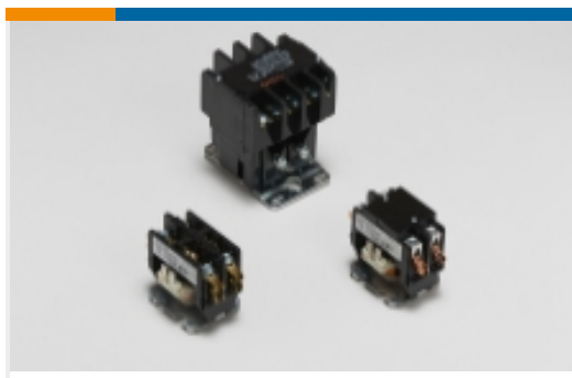
Definite Purpose Contactors(2)