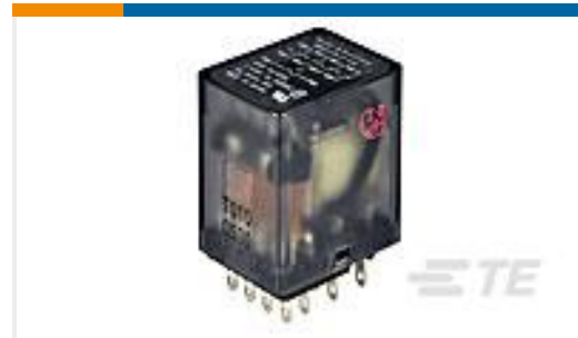
TE Part #5-1393122-5 KHAU-17D12-12=KH