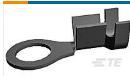
TE Part #61397-1 RING TERMINAL CRIMP 18-14 AWG TPBR