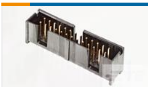
TE Part #1-1761681-1 IDC LOW PRO HDR 34P VERT HT BLACK