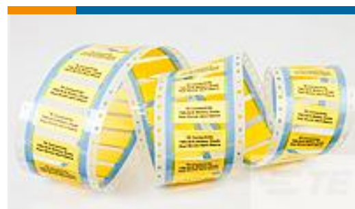
TE Part #1505370001 TMS-SCE-1K-1-1/2-2.0-9