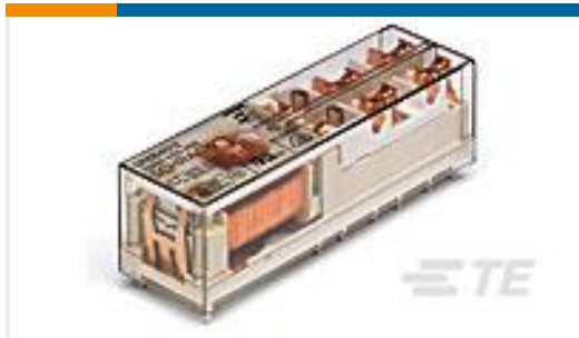
TE Part #1-1393260-3 SR6B4110 - V23050-A1110-A542