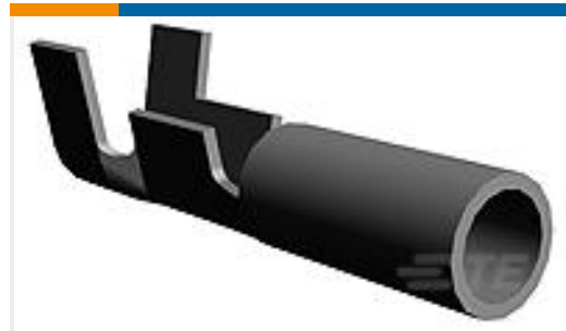
TE Part #41854 PIN 093 (2.36 MM) REC 22-18 AWG TPBR