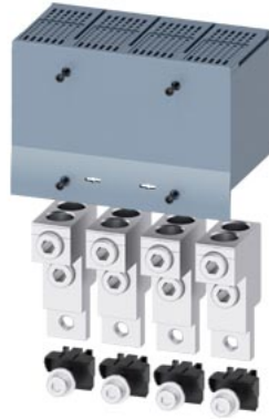
wire connector 2 cables 4 units accessory for: 3VA5 250